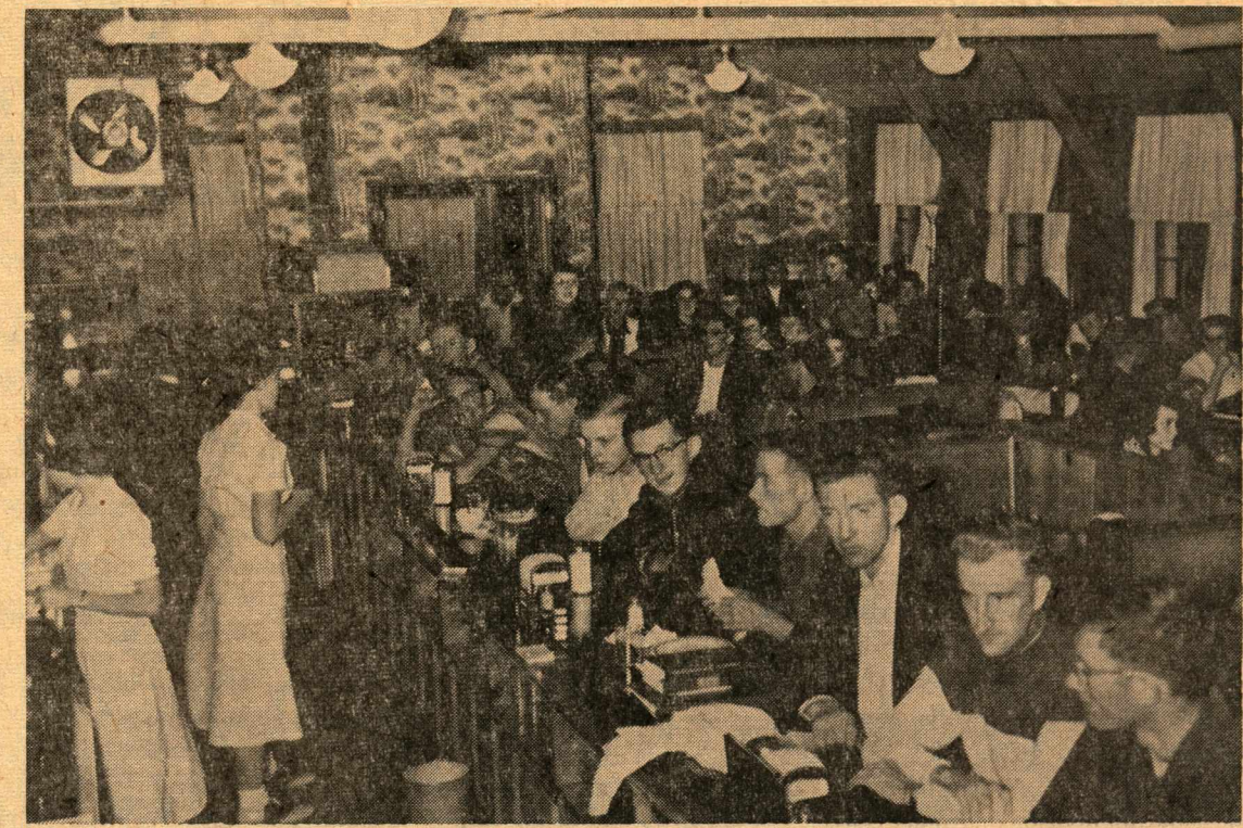
Students enjoy last minute snacks in the newly redecorated Coffee Shop. The building and the kitchen received a complete remodeling job, plus the installation of new equipment during the summer months.