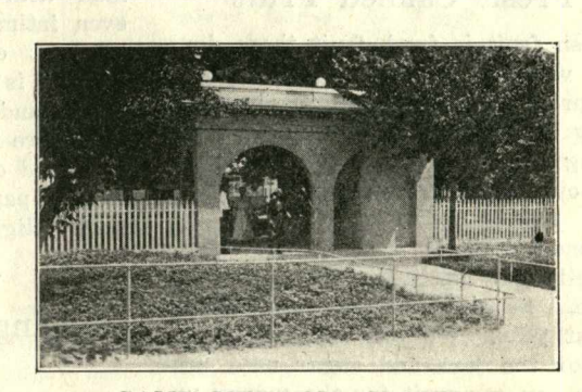
CAMP MEETING GROUNDS