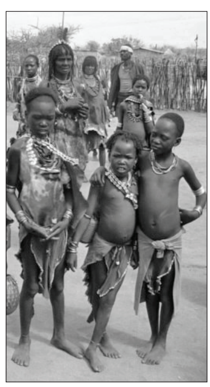
The children from a remote tribe were very interested in seeing me. Rarely did they encounter white men in their village. Although we did not speak their language, we had some precious minutes trying to communicate through gestures and facial expressions.

Their homes were nothing but lean-tos constructed out of maize stalks. I could