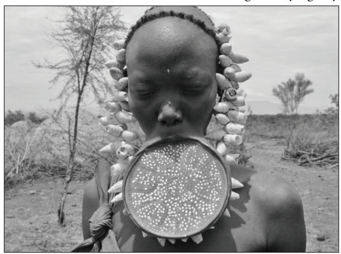
This young Mursi woman allowed me to take her picture on one of my encounters with the Mursi people. It was seeing a photo such as this that piqued my interest to visit this amazing people.

It was a three-day over-the-road journey to get to the area where the Mursi lived. We spent the night in Arba Minch before departing early in the morning to a sometimes-hazardous journey through the South Omo [OH-moh] area of Ethiopia. The road wound through a multitude of dry riverbeds, taking us to the town of Jinka [JEEN-kah], the last town of any size in the southwest corner of Ethiopia. The desert-like terrain was deceptive—rain in the mountains usually went unnoticed by travelers in the desert below. One moment the riverbed was dusty and dry, and moments later a flash flood rushed through, carrying any