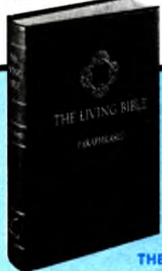
THE LIVING BIBLE

A thought-for-thought paraphrasing by Dr. Kenneth N. Taylor of the Bible in everyday language. Over 3 million copies in print! 1,020 pages, 5 1/2 x 8 1/2 x 1 1/4". Padded Kivar-board binding.