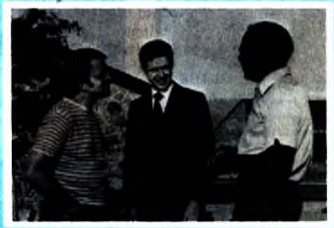
"WE'RE DOING OUR PART" (Record enrollment, fall, '73)