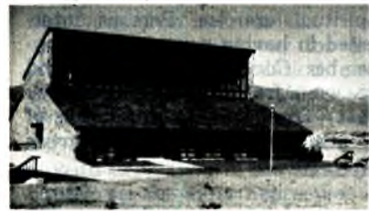
New Classroom Building