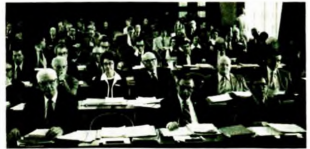
General Board members and guests on the east side of the auditorium listen to committee reports during Tuesday afternoon session.