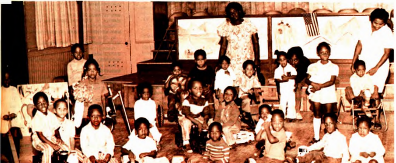
Children in the day nursery at the Richmond (Va.) Woodville church

"The world will never believe the message of God until blacks and whites forget traditions and begin to fellowship in the will of God together." □