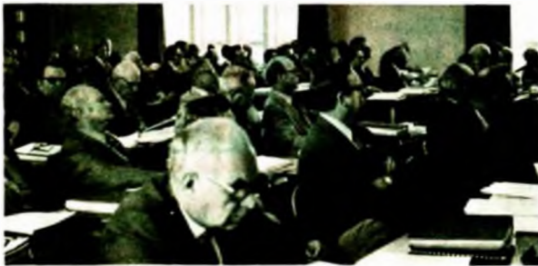
Elected lay and ministerial representatives from all church zones assemble in general meetings to care for the official business of the church.