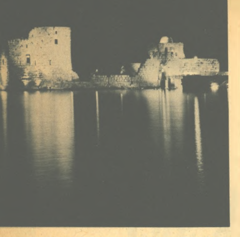
NEAR SIDON, twenty-five miles down the coast from Beirut, Lebanon, lie waterfront ruins left by Crusaders, but which date back to the Phoenicians, who existed before Christ.