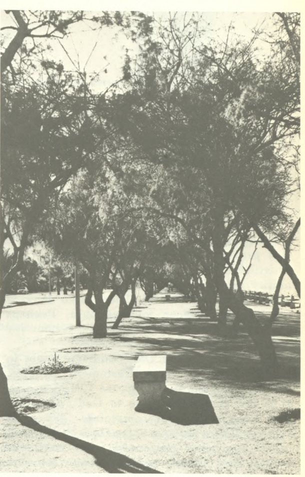
At one of the quieter spots in Beirut, the corniche overlooks the sea.