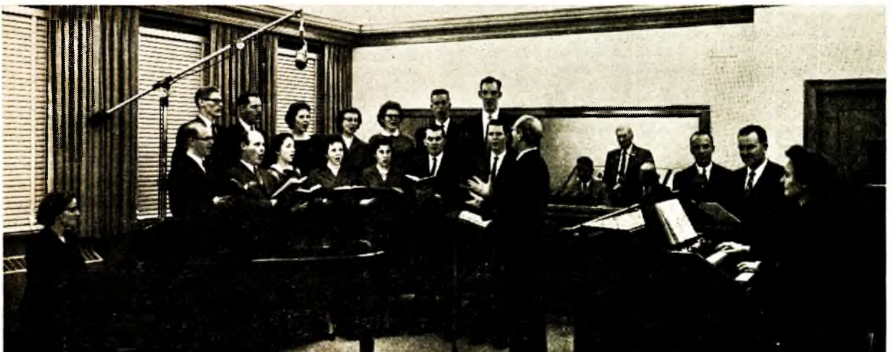
A typical studio scene at "Showers of Blessing" recording

"Showers of Blessing" undoubtedly has had a telling effect in the rapid development of the Church of the Nazarene in the Kansas City area, where the number of churches has gone from eight to twenty-four in the last fifteen years. YES, RADIO PAYS IN THE LONG RUN.