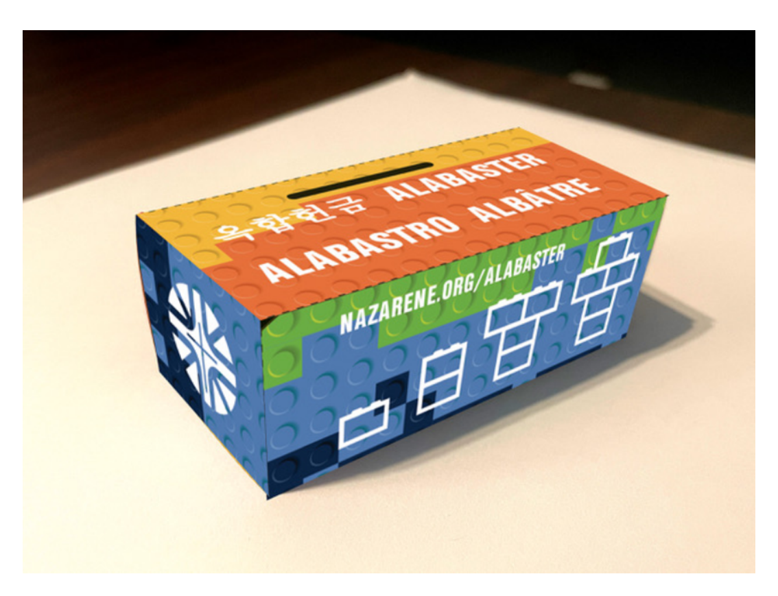
Newly designed children's Alabaster box.

To download a video to introduce the Alabaster 75th Anniversary celebration, click here.