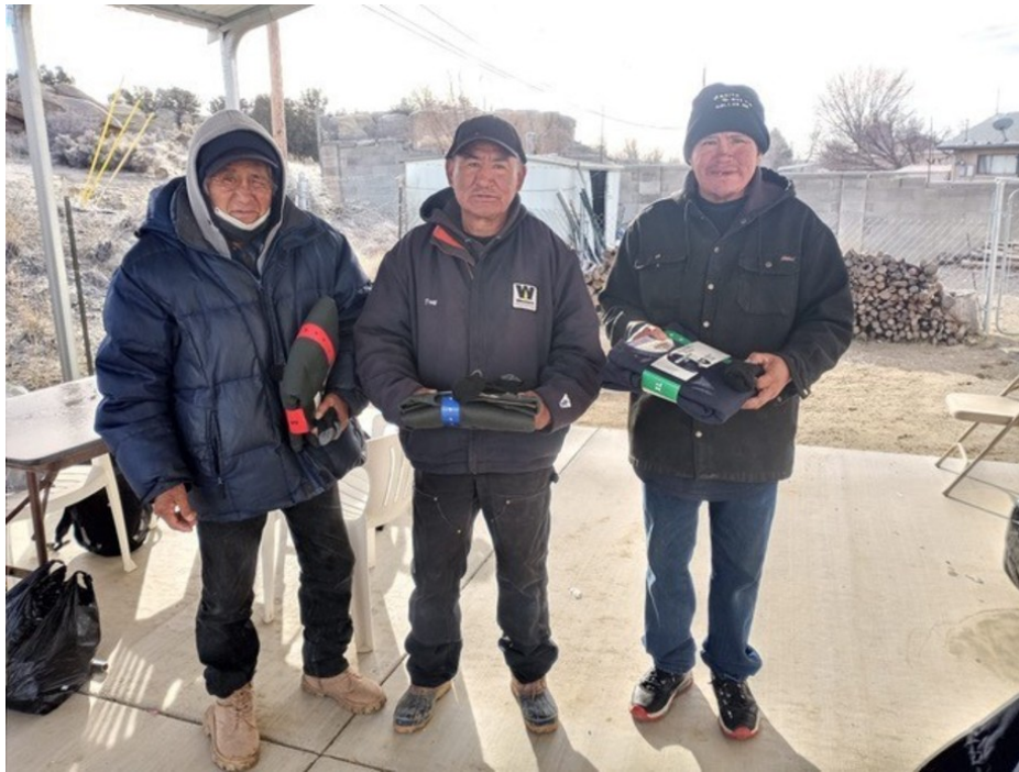
Distribution of clothing and supplies in the Gallup community

Along with ministering to the elderly, she holds Bible studies with the women on the reservation. Because of her connection and faithfulness in serving the women and elderly, she is now being invited by the men of the reservation to teach Bible studies in their men-only meeting lodges, often called “sweat lodges.”