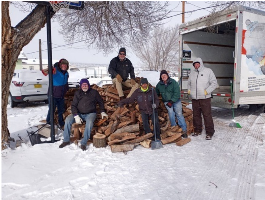
Delivery of fire wood from Bethany, Oklahoma First Church of the Nazarene