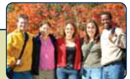
MVNU enrollment pushes past 2,000.