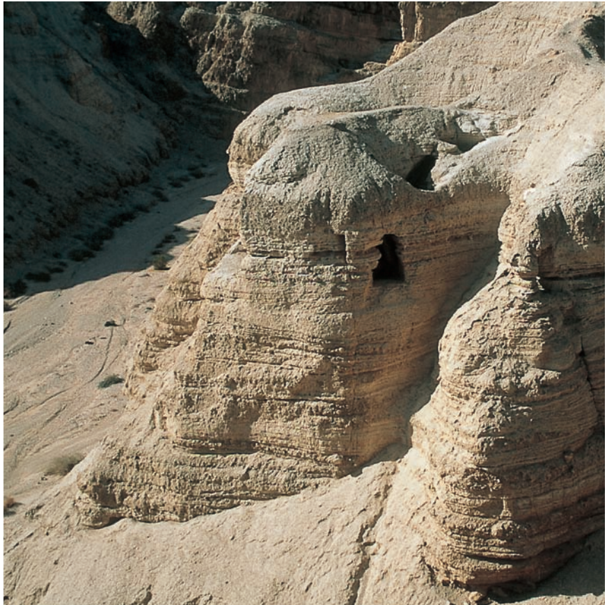
Qumran Cave IV, which contained a nearly complete copy of the Greek translation of the 12 minor prophets.

lical events focus on the life and ministry of Moses. The stories of Exodus, Leviticus, Numbers, and Deuteronomy belong to the Mosaic period. Perhaps a substantial part of these stories remained as Israel's oral tradition (orally transmitted stories from one generation to another) for another three or more centuries before they were fixed in a written form. It is also possible that large portions of the Books of Joshua, Judges, 1 and 2 Samuel, and 1 and 2 Kings existed in the form of oral tradition for a considerable period of time. Books of the Prophets belong to a period between the 8th and the 5th century B.C. Most of the Writings also could be dated to this period. It is likely that most of the Old Testa-