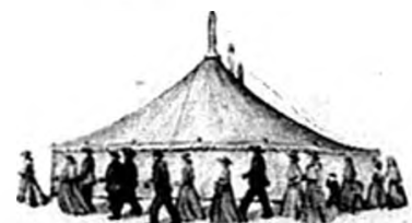
Founding General Assembly, Pilot Point, 1908

The Nazarene Archives is generally open by appointment during business hours. Copying services for documents, photographs, and audio recordings are provided for a fee. The archives has no research staff, but will respond to questions which can be answered in a brief letter. Larger requests may require either a visit by the researcher or the hiring of an assistant. The archives will be glad to recommend someone as a research assistant.