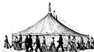
Founding General Assembly, Pilot Point, 1908