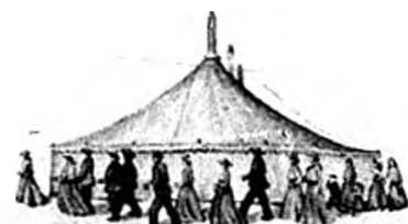
Founding General Assembly, Pilot Point, 1908

The collections are largely focused on the denominational rather than the district or local level of the church. However, the archives does maintain what may be the most complete collection of Nazarene district assembly journals (1908- ) and a sizeable concentration of records from the American Nazarene schools. The materials related to the religious bodies which formed or later joined the Church of the Nazarene are another significant collection.